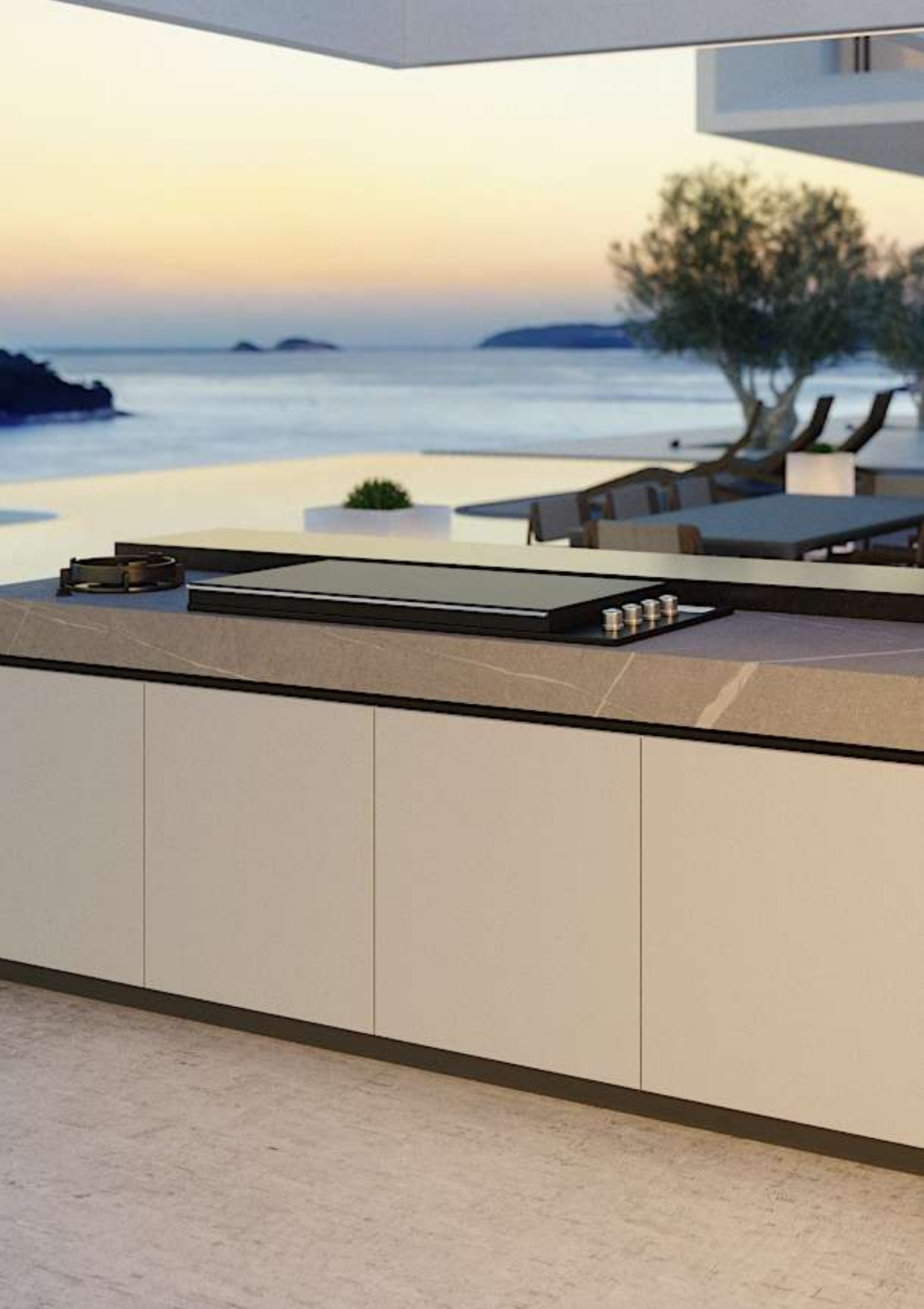
The "Savoir Faire" outside kitchen